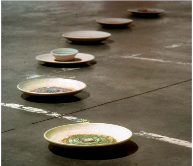
'Untitled Unvessel'd', 2002, fired and decomposing unfired clay, coloured slips

Email: sschh@earthlink.net Web: www.home.earthlink.net/~sschh/