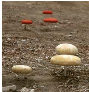
'Jurassic Martian Landscape' (detail), 2000, clay, sand, plexiglass rods, river rock, 152 x 305 m