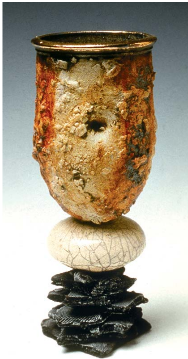
'Craggy Goblet', 2001, ceramic, ht 23 cm