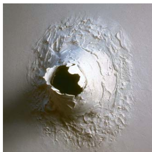
'Wall Eruption' (detail), 2000, clay, black velvet, 91 x 91 x 61 cm