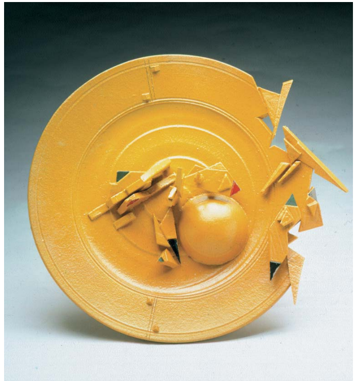
'Plane Platter', 2003, multi-fired clay, yellow slip, diam. 56 x 76 cm