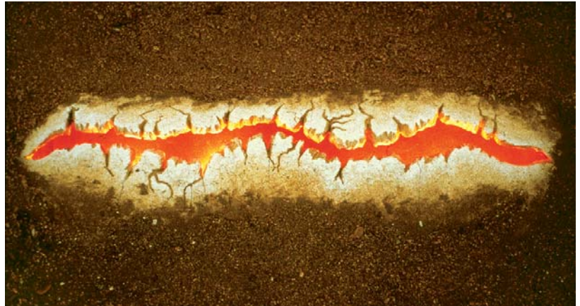
'Floor Eruption' (detail), 2000, clay, dirt, lights